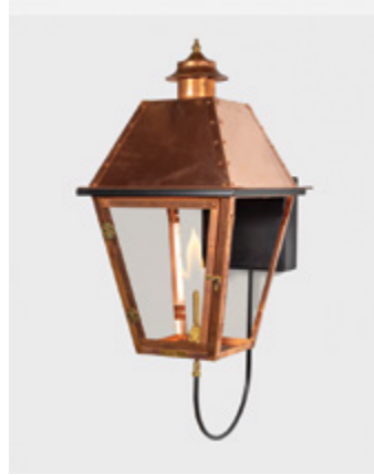
Iron Wall Bracket Mount