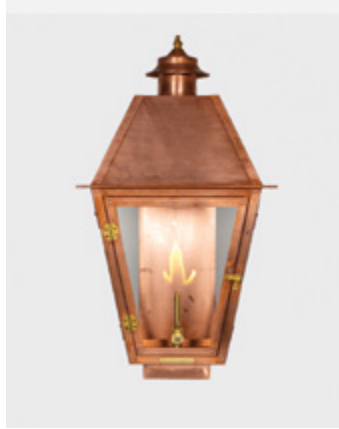
Copper Wallbox Mount