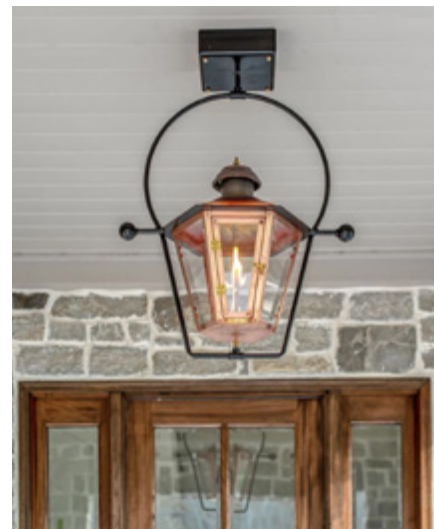
The Athena in Natural Copper with Iron Yoke Bracket Mount.