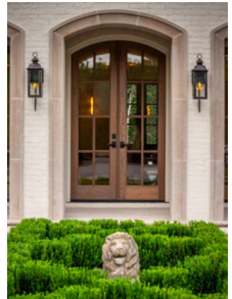
Pictured Right: The Vulcan in Natural Copper with Iron Wall Bracket Mount.

All lights can also come with incandescent fixtures for LED and traditional light bulbs.