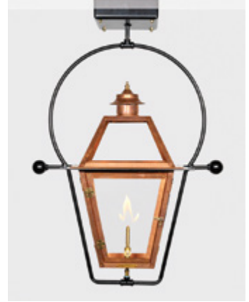
Iron Yoke Ceiling Mount

Refer to the Product Specification Sheets for compatible mounting options for each lamp.