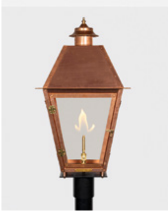
Iron Post Bracket Mount