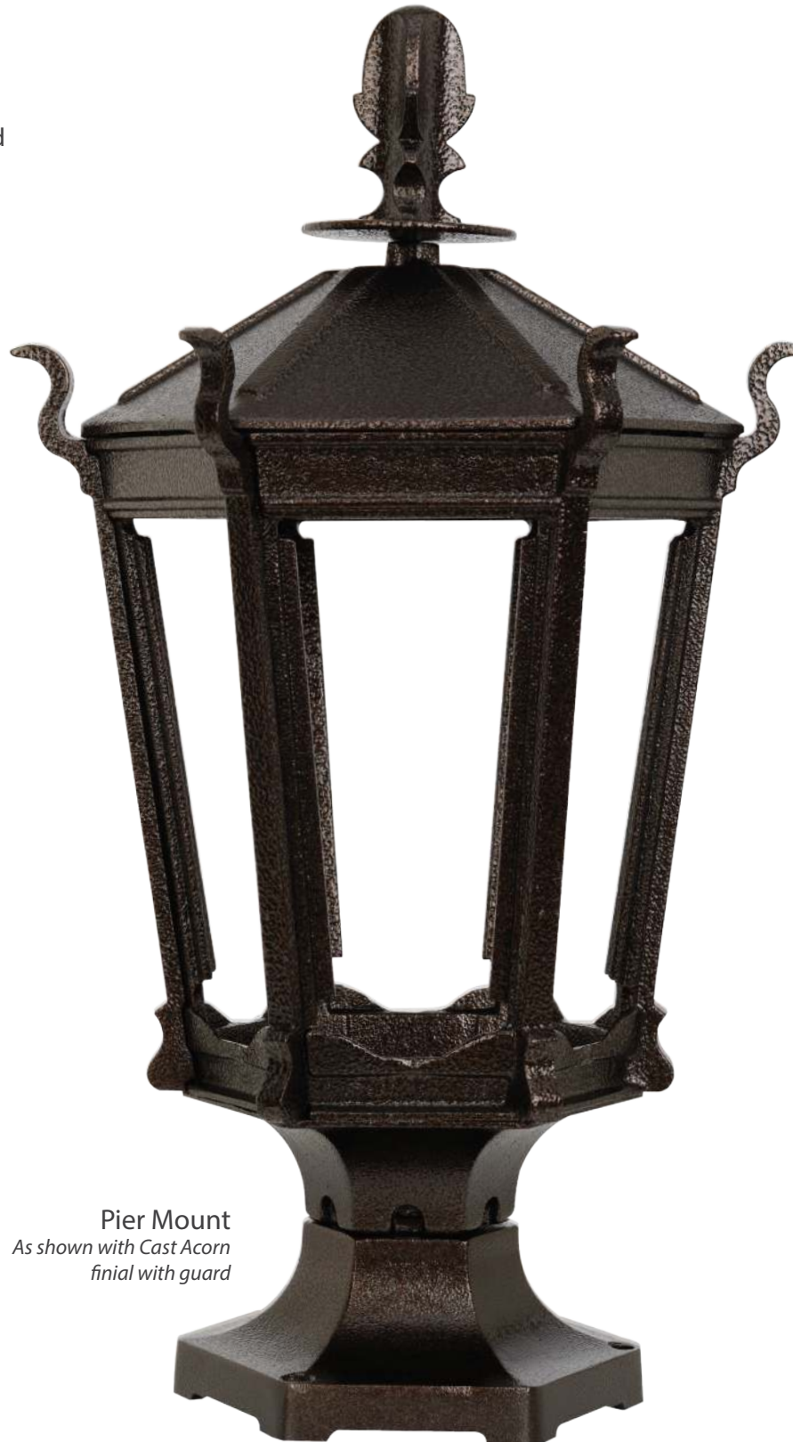
Pier Mount As shown with Cast Acorn finial with guard