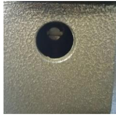
Figure B (valve stem slot in “off” position)