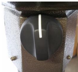
Figure D (knob in “on” position)