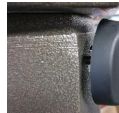
Figure F (distance between the knob & torch)