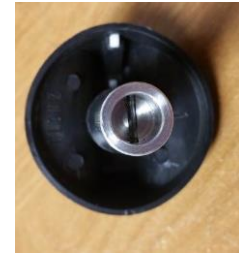
Figure C (pin inside knob stem)