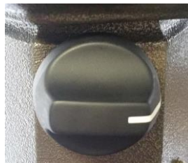
Figure E (knob in “off” position)